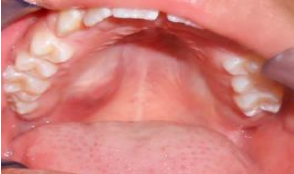
Figure 1. Initial clinical presentation