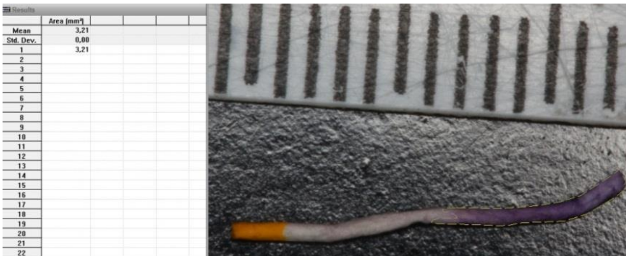
Figure 1. Gingival crevicular fluid collection area in the photographic image.